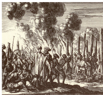
About eighty Waldensians burned in Strasbourg, AD 1215

Our attitude toward most evangelical historians stems from their stated mode of operation. For example, they admit that they know that Rome hunted down "heretics". They know that Rome murdered every man, woman and child they found in the ranks of the heretics. They know that Rome burnt their churches, Bibles, hymnals, books and other writings. They even know that Rome sought out ANY documentation that showed heretics in a positive light and destroyed it.